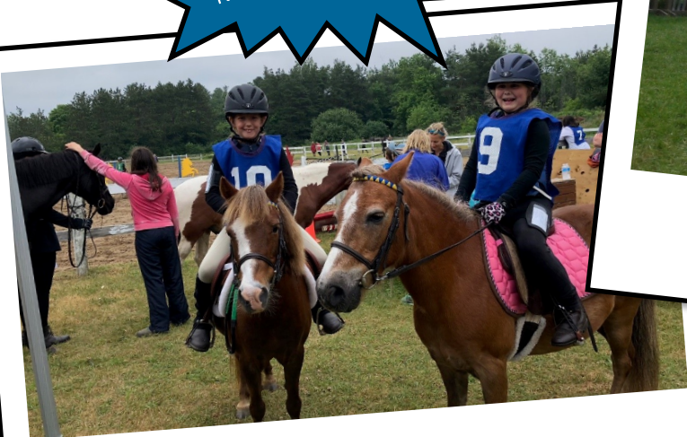
June: Fun Rally