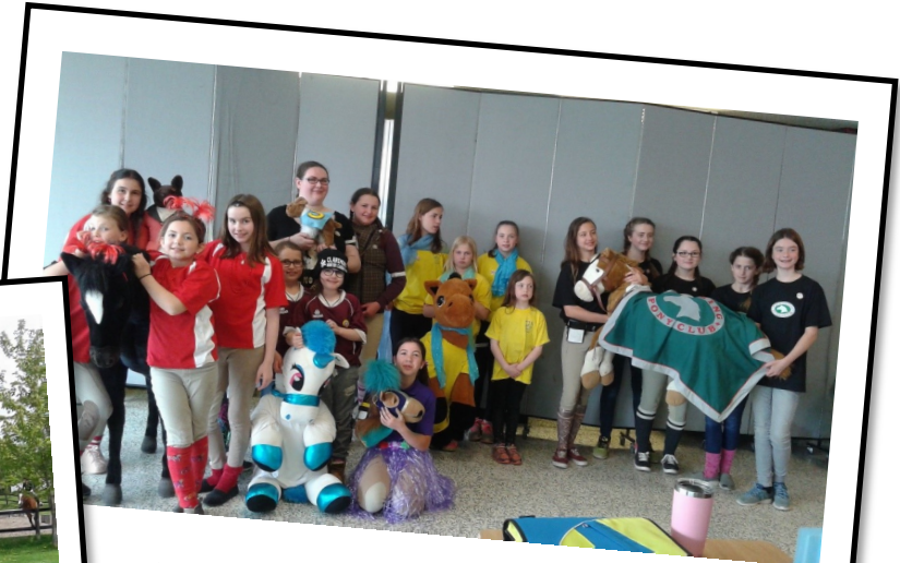
April: Regional Quiz